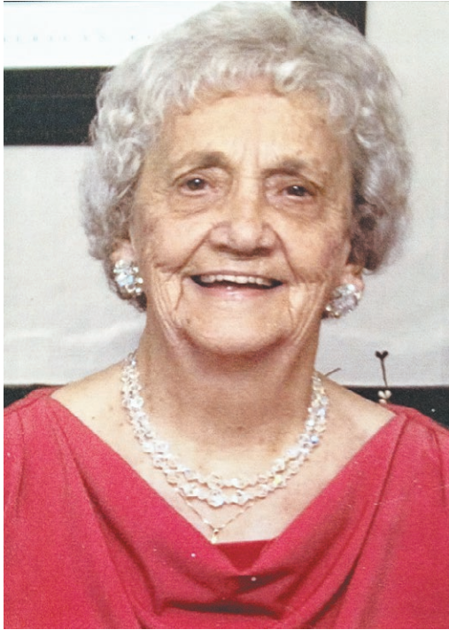
50 year Member GFWC-WV Ronceverte Woman's Club

Plan to attend Southeastern Region Meeting November 4-5, 2016 The Greenbrier